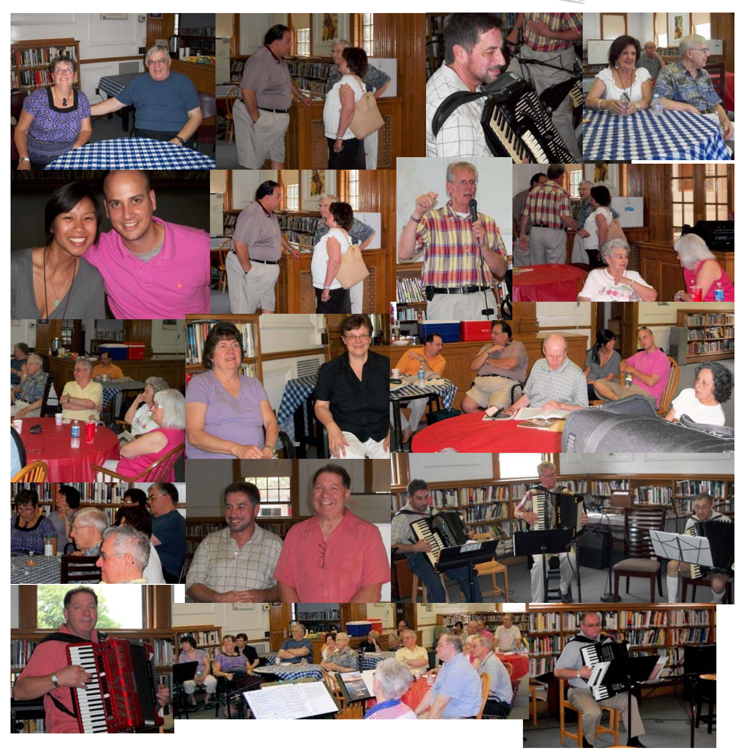
What a great time...we met many new friends and saw some we haven't seen in a while join us for our June meeting. We even had a newly wed couple come and join us. I'll bet you can pick them out from above.