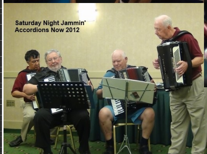
Saturday Night Jammin' Accordions Now 2012