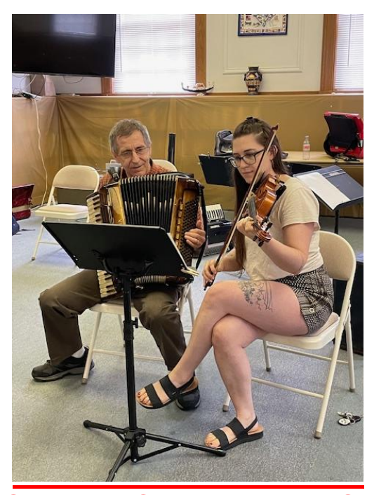
GREAT JOB! THANK YOU