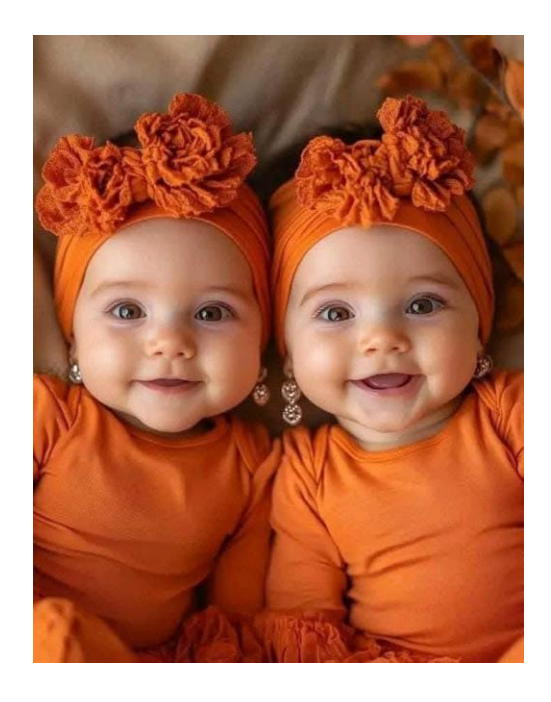
Smiles Are Contagious! Start the Epidemic!