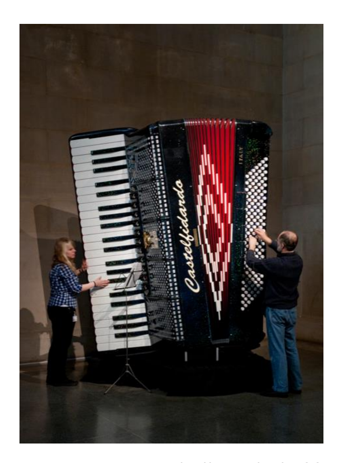
Anyone want to bellow shake??